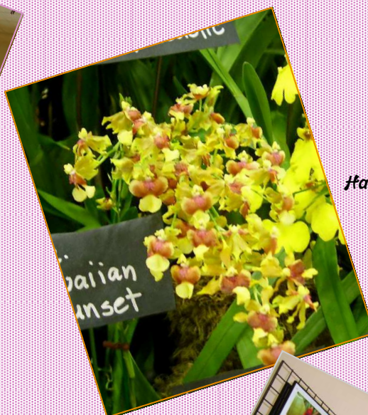
Oncidium Hawaiian Sunset