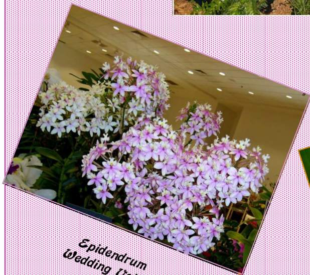
Epidendrum wedding valley