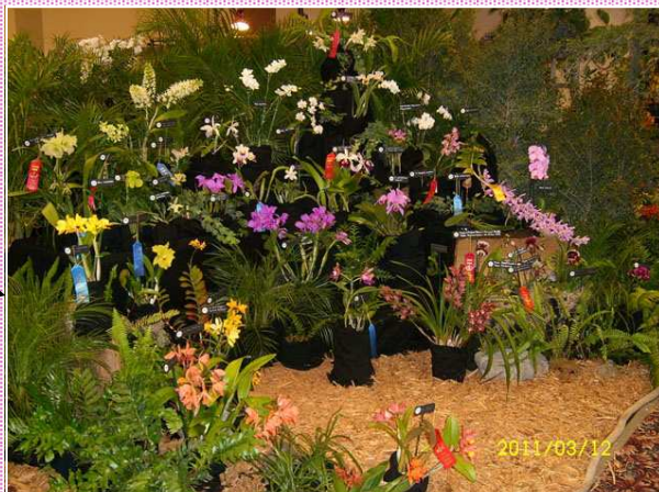
The Winning Floor Display, Installed by Vero Beach Orchid Society