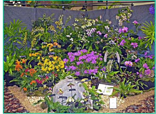
A Floor Display at our March Show