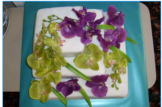
"The Cake" on Judging Day.