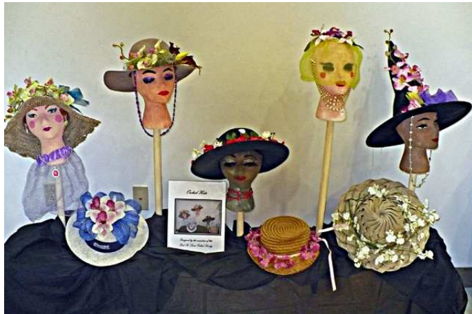
A few of the nifty "orchid hats" displayed at our show!