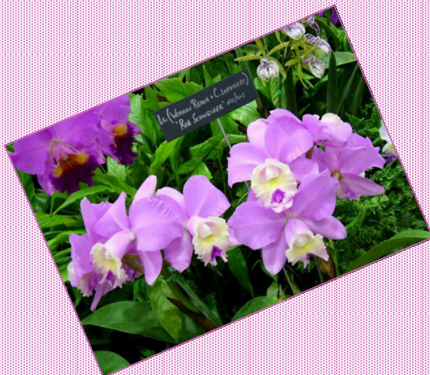
C. Rob Schneider