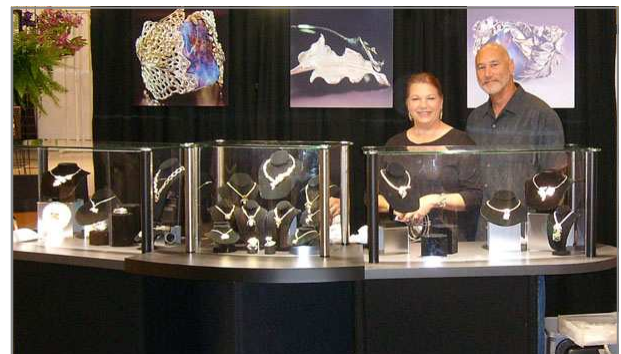
Our Silver Orchid Jewelry Vendors