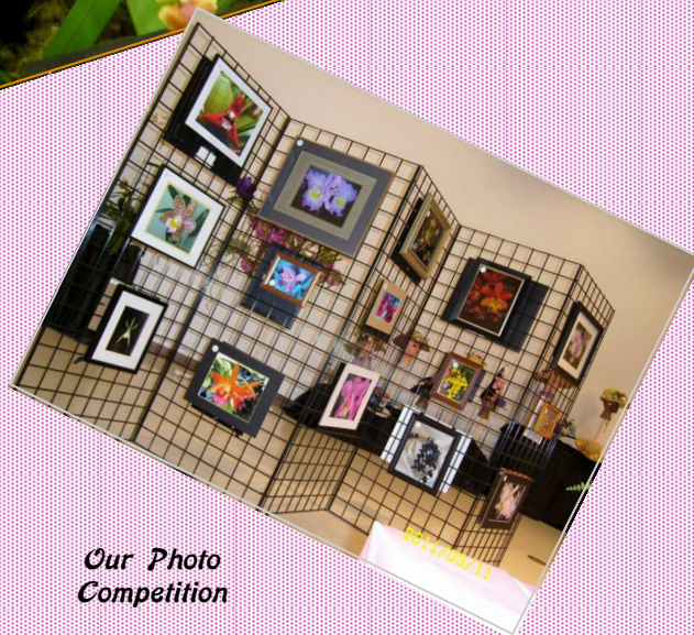
Our Photo Competition