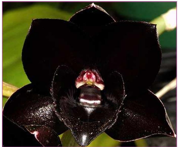
Fdk. After Dark

Created and grown by our speaker this month.