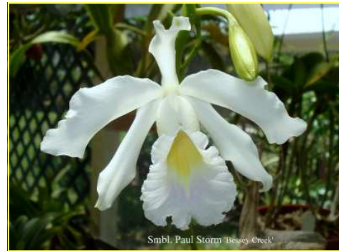
Schombolaelia Paul Storm 'Bessey Creek'