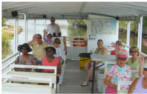
Up that lazy river before lunch!