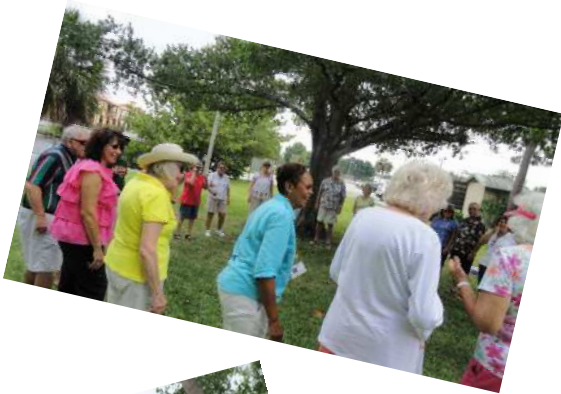
Some fun and Games!