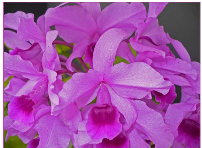
Cattleya Hail Storm ( C. bowringiana x C. skinneri )