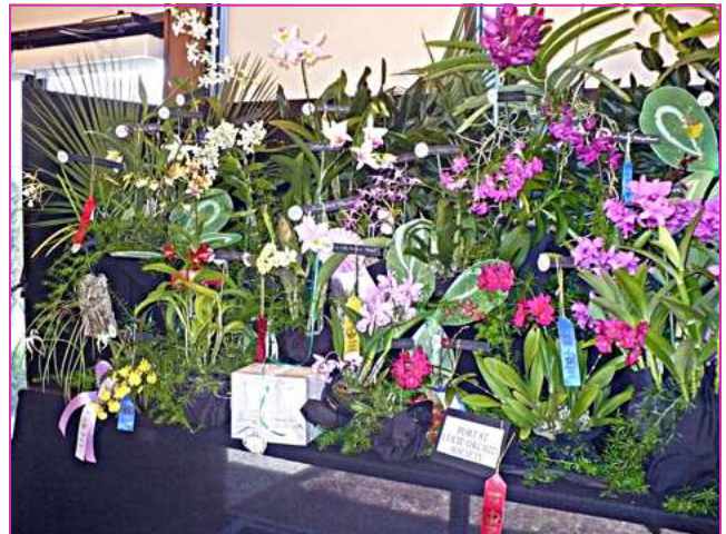
Port St. Lucie Orchid Society's display at the Fort Pierce Orchid Society show