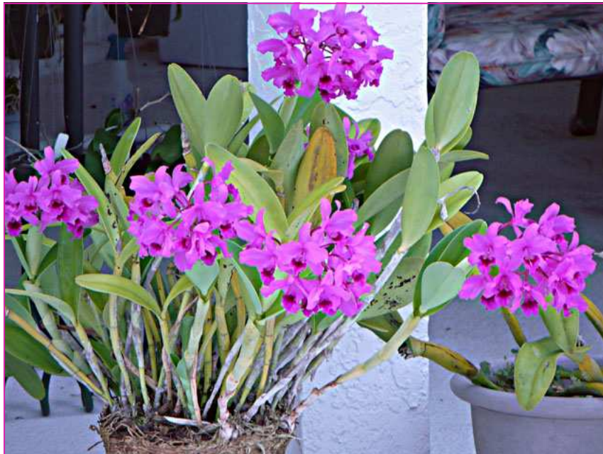
C. bowringiana, blooming its heart out, and reminding us why we grow these fabulous plants