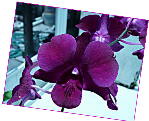
Dendrobium Dark Plush