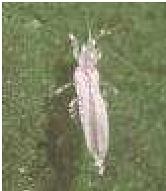
A photo of a thrip, found on the web