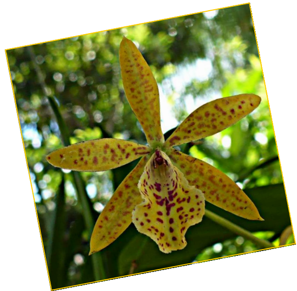
Epl. Golden Spice 'Red Peppers'

Board Meeting Tuesday, September 20th 1:00 PM Port St. Lucie Police Station, Airoso Blvd. All members are welcome at Board meetings