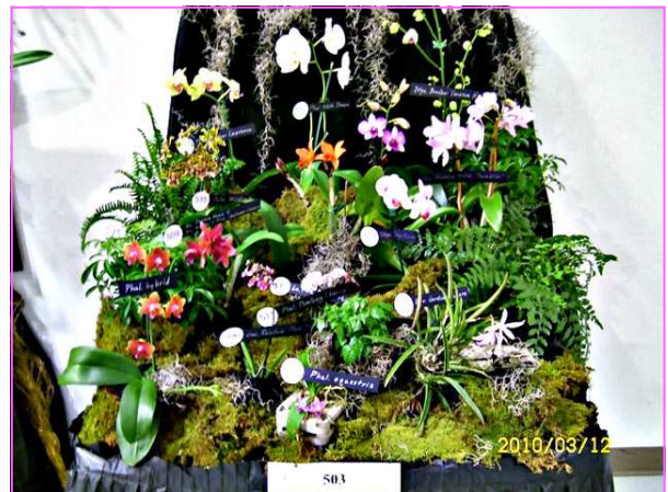
Fabulous Displays at Our Show!