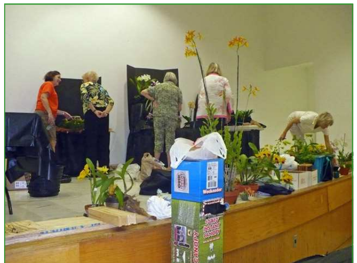
What the public didn't see—the work behind the scenes at our show!