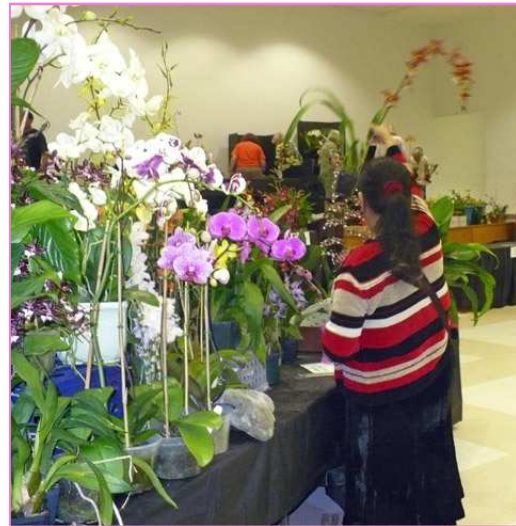
A Vendor Display

Visit the fabulous AOS web site! www.aos.org