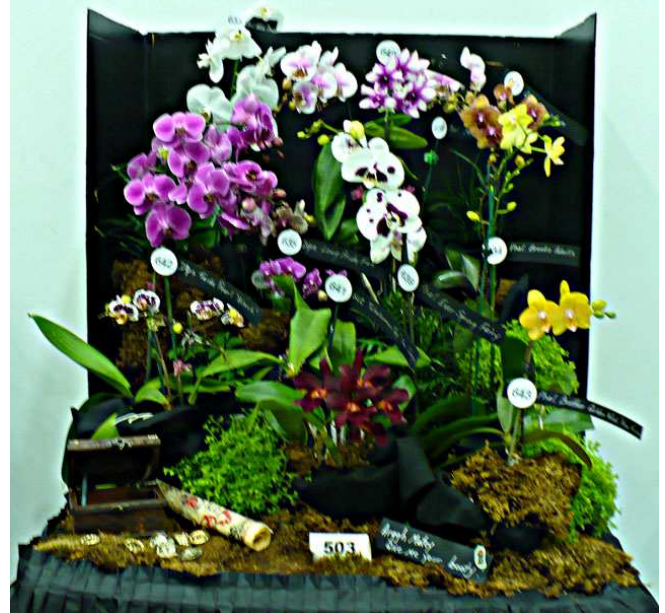
A Table Top Display at Our 2009 Show!

Visit the fabulous AOS web site! www.aos.org