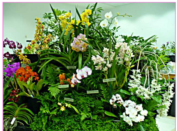
From our 2009 Show! Top, a fabulous floor display. Above, a vendor's display.